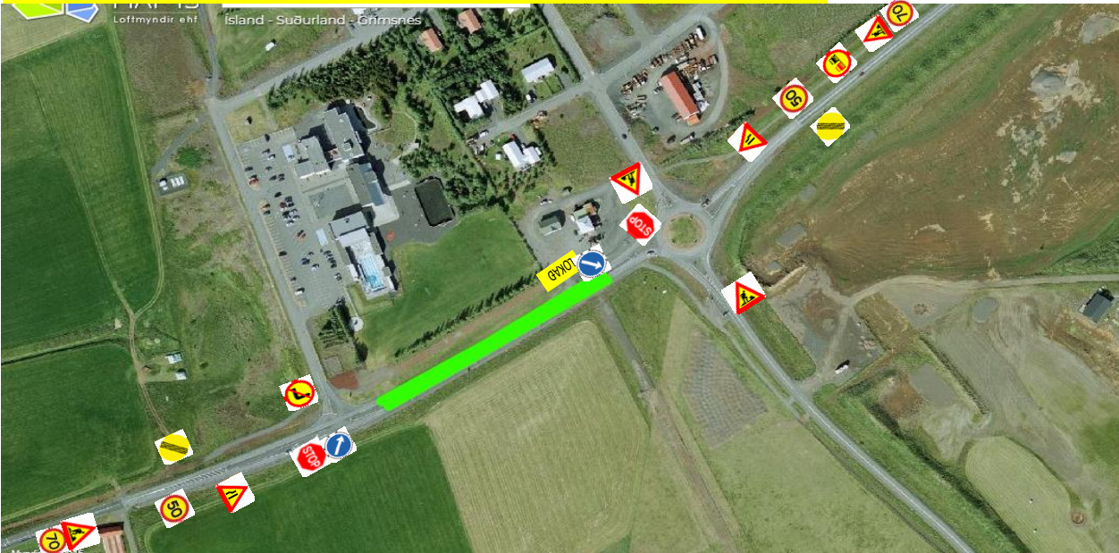
Kaflinn er 200m langur og verður umferðarstýring samkvæmt teikningu 3.5.2.1.